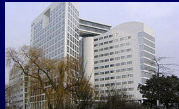
ICC building, The Hague 2003 -