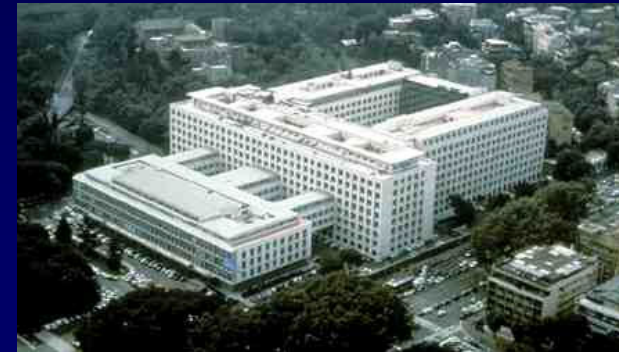
FAO building, Rome 1993 - 2000