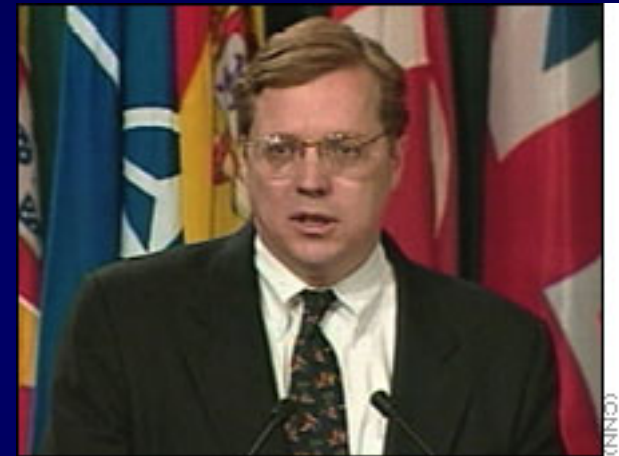
David Scheffer Amb USA