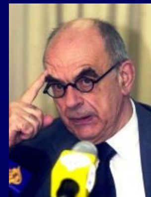
UN envoy Jan Pronk